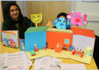
Year 9 make resources to send to the nursery school we are twinned with in Ghana in an L4L session on being a world citizen

The L4L programme also ensure that all the skills employers and Universities are constantly after—such as being able to work independently, the ability to problem solve and reflect on our own practice—are taught discreetly and practised.